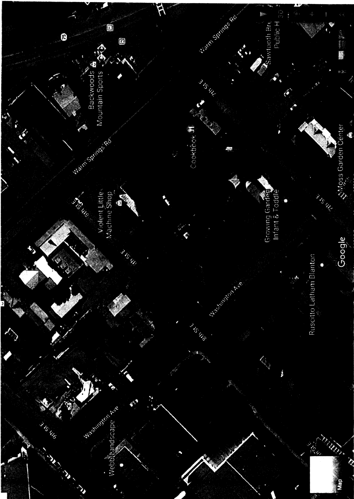
EXHIBIT A PROJECT SITE